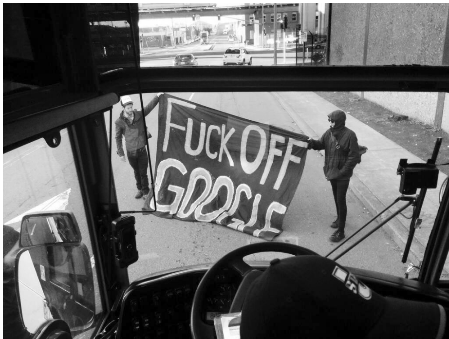
Excerpt from « To Our Friends », translations coming soon. @anosamis - bloom0101.org